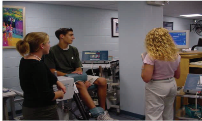
Hands-on collaborative learning during weekend courses!

The Orthopaedic Physical Therapy Residency at Temple University is unique in that practicing clinicians remain at their own site of practice while advancing their evidence based orthopaedic skills and knowledge.